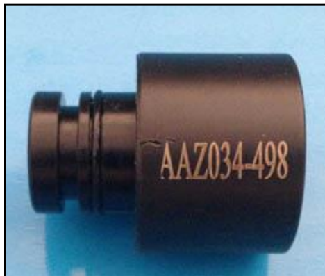
AAZ034-498 POSITIONING DEVICE X EXTERNAL OIL-SEAL ON PUMPS DFP3 Similar: YDT498