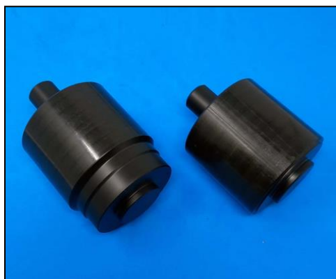
AAZ051-CP5 OIL-SEAL INSERTER'S KIT ON CPN5 – DIAM. 58 e 60MM