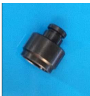
AAZ034-493 POSITIONING DEVICE X INTERNAL OIL-SEAL ON PUMPS DFP3 Similar: YDT493